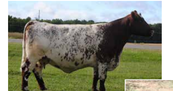
NBS Daphne 36A