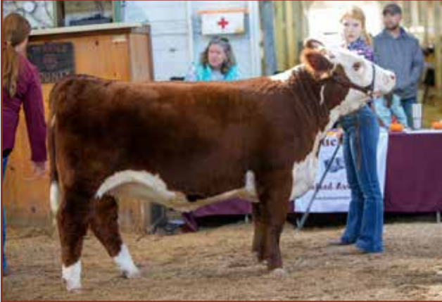
Lot 33 — EML ZELDA IS CUSTOM MADE J012