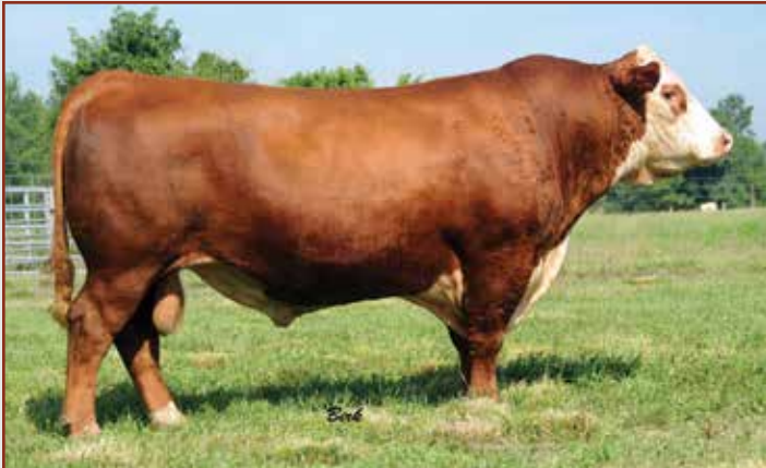
BOYD WORLDWIDE 9050 ET — Sire of Lot 34