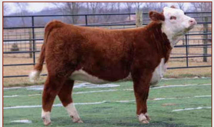
Lot 18 — KT PATCHES 305L

• Reserve Champion Heifer at the county fair. KT Patches 305L sire was 2021 NAILE Grand Champion Bull she will make a great breeding piece. Don't over look her!