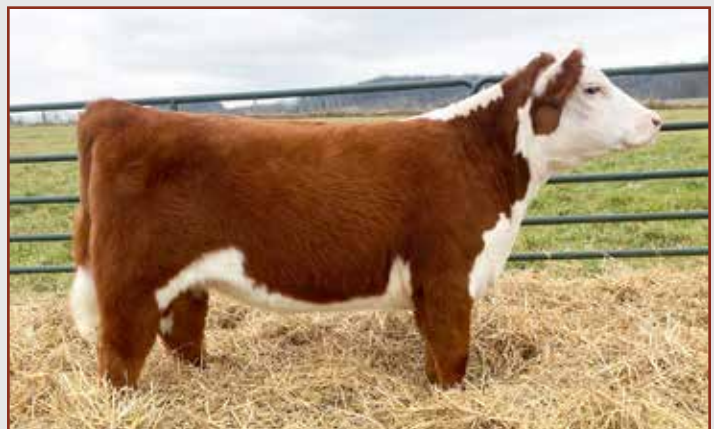
Lot 6 — CREEK MASON 202 ANNIE L322 ET

Annie is a long fronted heifer that has great hair. Her neck ties in high on the top of her shoulders and has a very smooth front end. She is wide hipped with a big top. She is a sure standout.