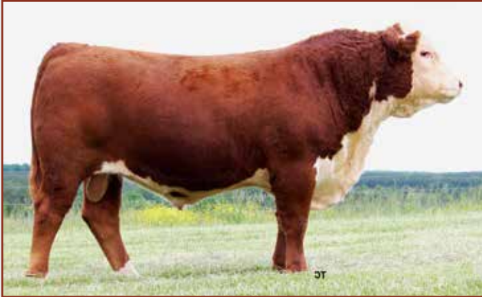
BEHM 100W CUDA 504C — Site of Lot 27