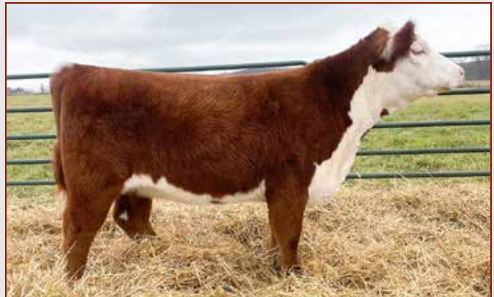
Lot 5 — CREEK 2296 109 MADAM 305L