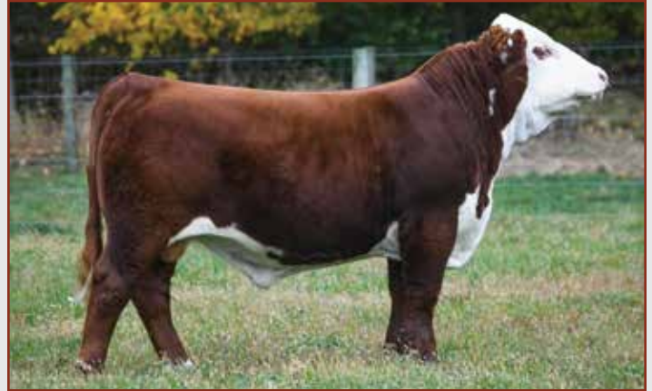
Lot 24 — SCC 989 112D TRADESMAN 012K