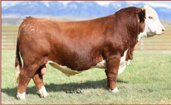
NJW LONG HAUL 36E ET — Service Sire of Lot 7