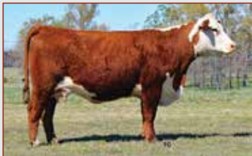
THM 078 WYNTER 4183 — Dam of 9A Lots