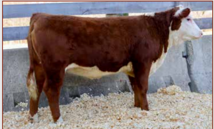
Lot 38 — THF CORAL 5L