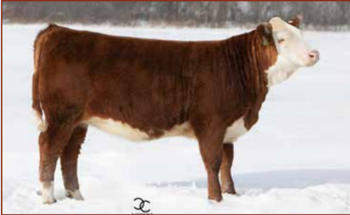
Lot 13 — SHAVER J6 LUCY SF17