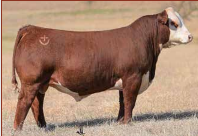
SHF HOUSTON D287 H086 — Sire of Lot 1