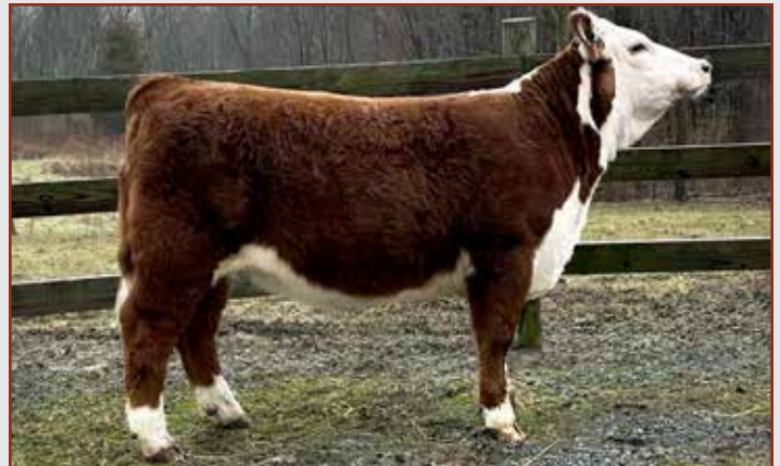
Lot 17 — DS 3G RITZIE 20L