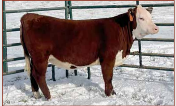
Lot 30 — DCL VANESSA 2311

DCL Vanessa 2311 is a yearling heifer. Her past siblings are like fine wine. They have proven to get better with age. Vanessa is a moderate framed female, that is good in terms of her rib shape, width and dimension from behind. She is easy going and has a laid-back personality. She will make a good cow momma if she follows in her maternal footsteps.