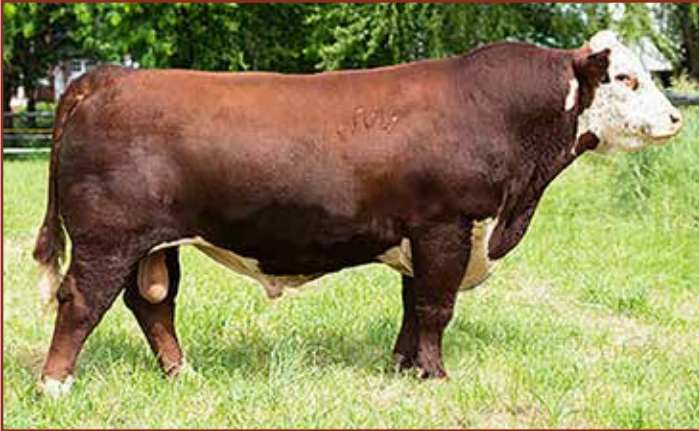
BIRDWELL VANGUARD 5022 9337 — Sire of Lot 10