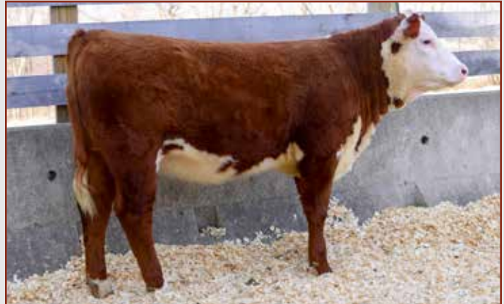
Lot 37 — THF THELMA 10L