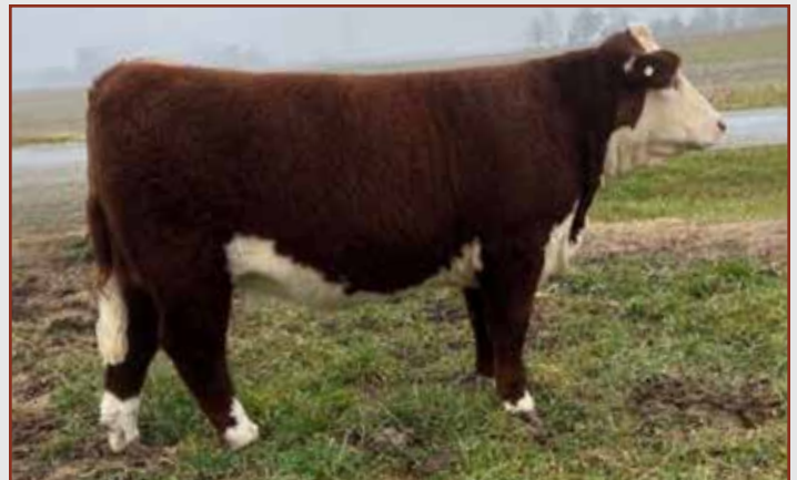
Lot 26 — IDB RMP BRP COTTIN PHOEBE K146

• Lot 26 IDB RMP BRP Cottin Phoebe K146 is a deep bodied short marked heifer out of KCW Cottonwood and BR Phoebe Cat 9070. Her dam was a high seller in the 2019 Barber Fall sale and offers power along with maternal traits. Phoebe will compete in the ring but more importantly make a great cow. • She was bred on 11/18/23 to S Mandate 66589 ET and blood verified safe on 12/19/23. The resulting calf's estimated EPDs will be BW 2.2 WW 68.5 YW 108 MM 23.5 MG 57.5