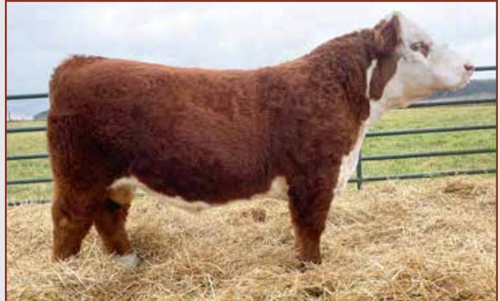
Lot 4 — CREEK 2504 914 CLEMSON 237K