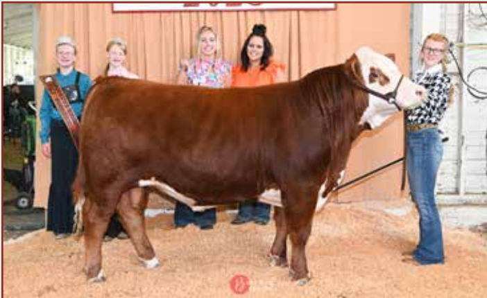
Lot 35 — EML ST. NICHOLAS K121