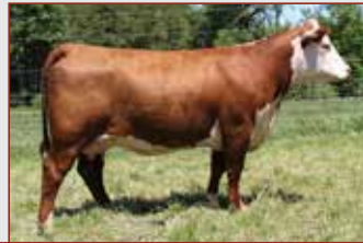
STONEWOOD YOPLAIT 2Y — Dam of 9B Lots