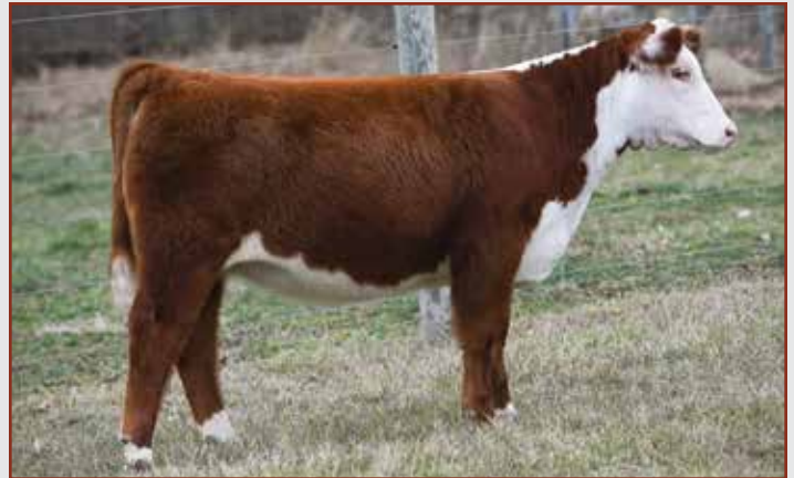
Lot 25 — SCC 515 D87 DOMINETTE 073L ET