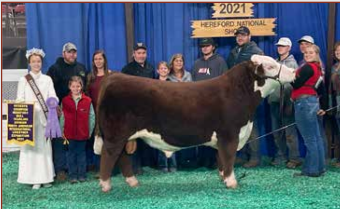
WILDCAT MF EL CHAPO 013 — Sire of Lot 8