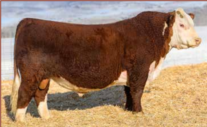
CHURCHILL RED THUNDER 133J — Service Sire of Lot 2