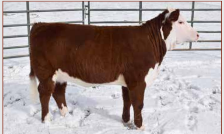
Lot 32 — DCL SCARLET 2336

DCL Scarlet 2336 is one of our most versatile yearling heifers. She has a classy look for the show ring, but she will also make yo a good cow. Her mother is one of our bigger framed cows and Scarlet looks to be following in her footsteps. Not only is her maternal structure good, but her motherly nurture is excellent. Scarlet will make you a good replacement heifer to add to your herd.