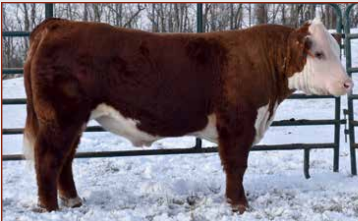
Lot 28 — DCL SHOWTIME FURY 2227