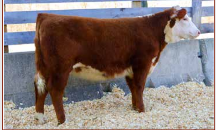
Lot 36 — THF MARISSA 9L