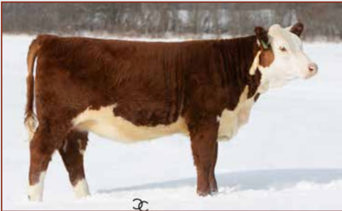
Lot 14 — SHAVER J6 LAURA SF24