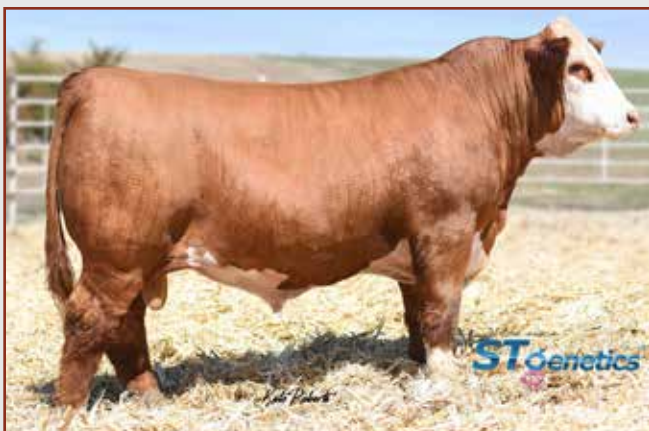
BG LCC 11B PERFECTO 84F — Lots 11 & 12 MGS