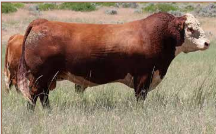
NWJ 139C 103C RIDGE 254G — Sire of Lot 15