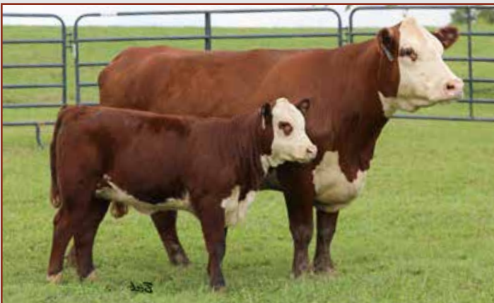
MOHICAN NASH A M58K — Lot 3 with her Dam