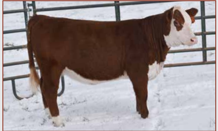
Lot 31 — DCL STELLA 2323

DCL Stella 2323 is a flashy yearling heifer with heavy goggled eyes. She will definitely stand out in your herd. Many of her desirable characteristics lead back to her father BOYD 31Z Blueprint 6153. Stella will serve as a productive replacement heifer. She is a smaller-framed traditional female who should be able to handle your bulls and calve for many years.