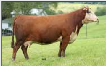
ASM 308 100W MISS ADAIR 429BET — Dam of Lot 9C