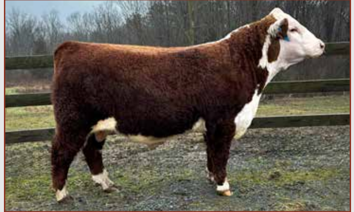
Lot 16 — 4G CORBIN 31Z