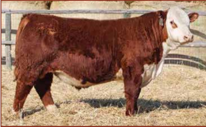
NJW 79Z 6589 REVOLVE 165G ET - Sire of Lots 19-23