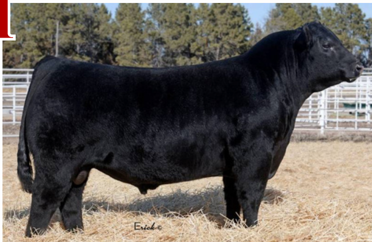
Sire of Lot 1: Car Don Annuity 114