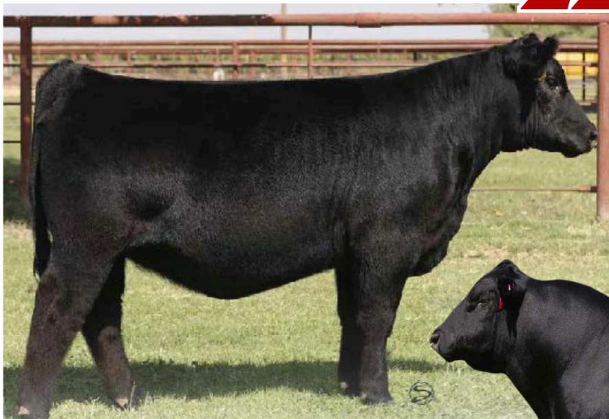
Silveiras Saras Dream 1321: Full Sister to Embryos

GCC New Game 5654C +*18324437 *Dameron First Class +*Duff NE 9375 Georgina 845 Silveiras Saras Dream 5535 +*18416550 +*Silveiras S Sis GQ 2353 +EXG Saras Dream S609 R3 EXG RS First Rate S903 R3 Dameron Northern Miss 3114 +*Duff New Edition 6108 WK Georgina 9375 +*Silveiras Style 9303 *K N C Cabin Creek Sandy 804 #BR Midland Exar Saras Dream 9809