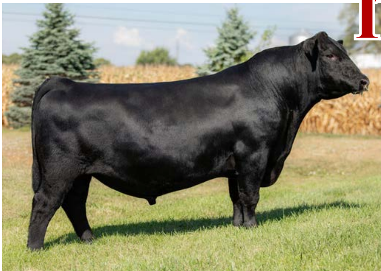
Sire of Lot 17: HPCA Veracious