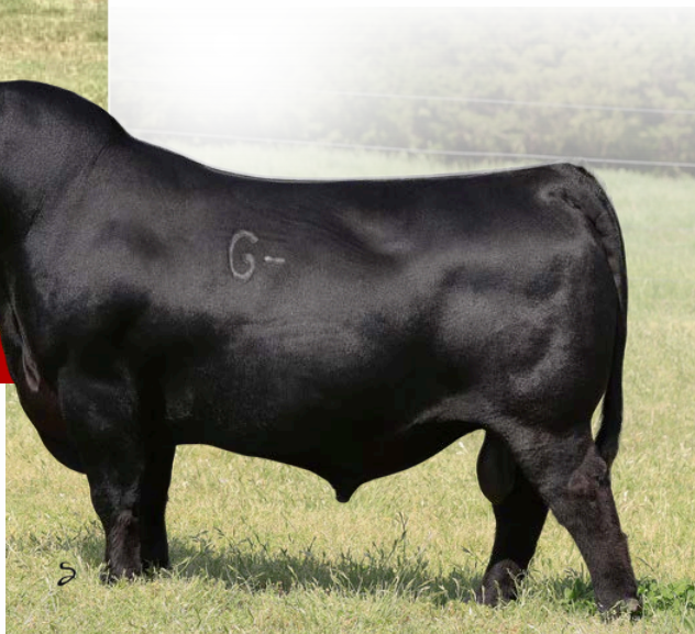
GCC New Game 5654C

Package of 3 Unsexed Conventional embryos, one pregnancy guaranteed if implanted by certified ET technician.