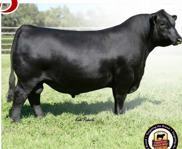
V A R Main Street 1083