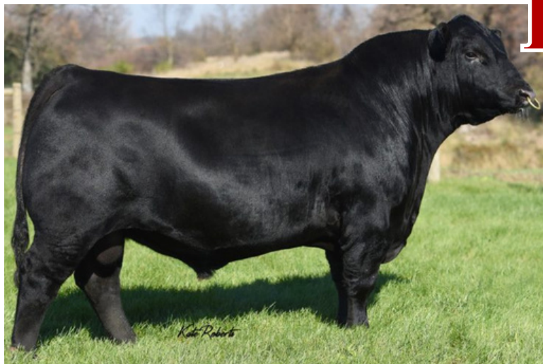
Sire of Lot 11: Werner Flat Top 4136